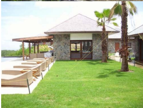
Living Room- during the construction process, and finished.