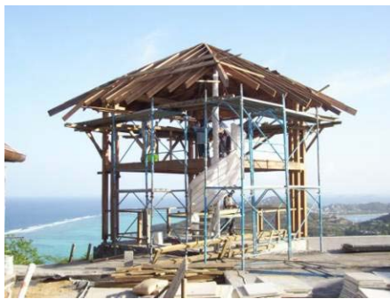
The wonderful Gazebo with views over Caranage Bay and across the whole island